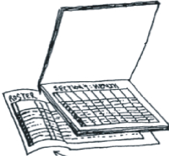
Household roster is pasted to inside back cover of the questionnaire.

Paying attention to the typestyles (fonts) used in the questionnaire will help you administer it. The table below lays out for you what you should expect when you see a particular typestyle. The examples in the table are in the typestyle noted.