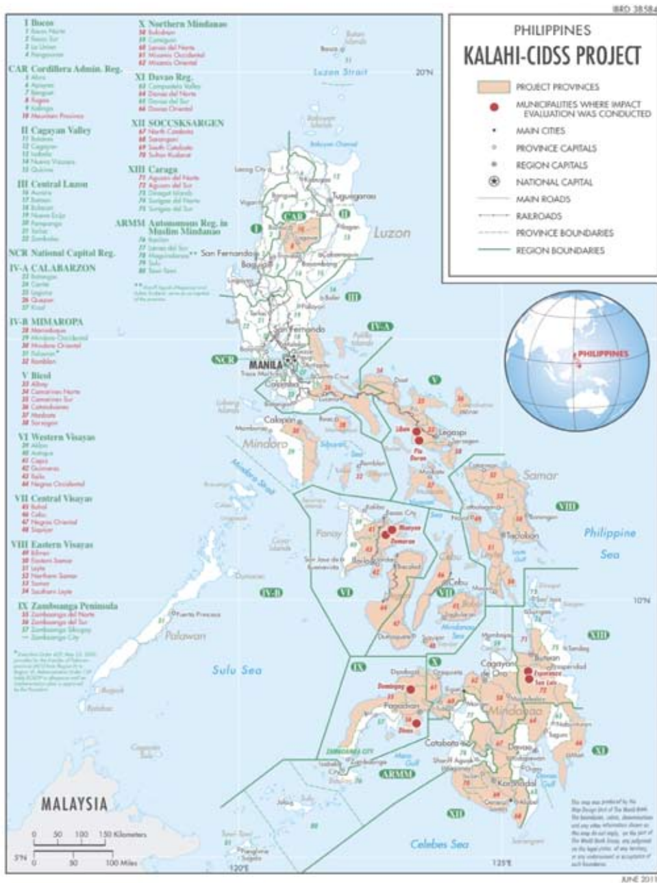
Figure A-1: Project Coverage