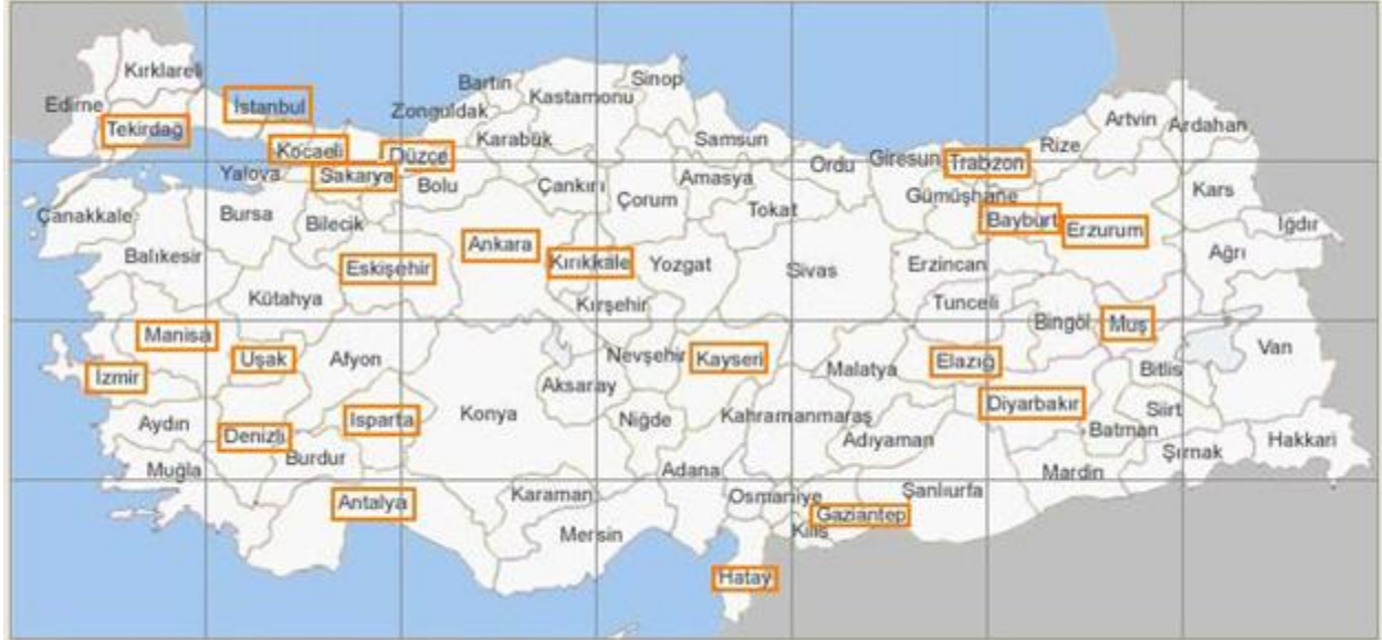
Figure 1: Geographic Distribution of Provinces

Provinces selected for experiment are indicated by orange rectangles around their names.