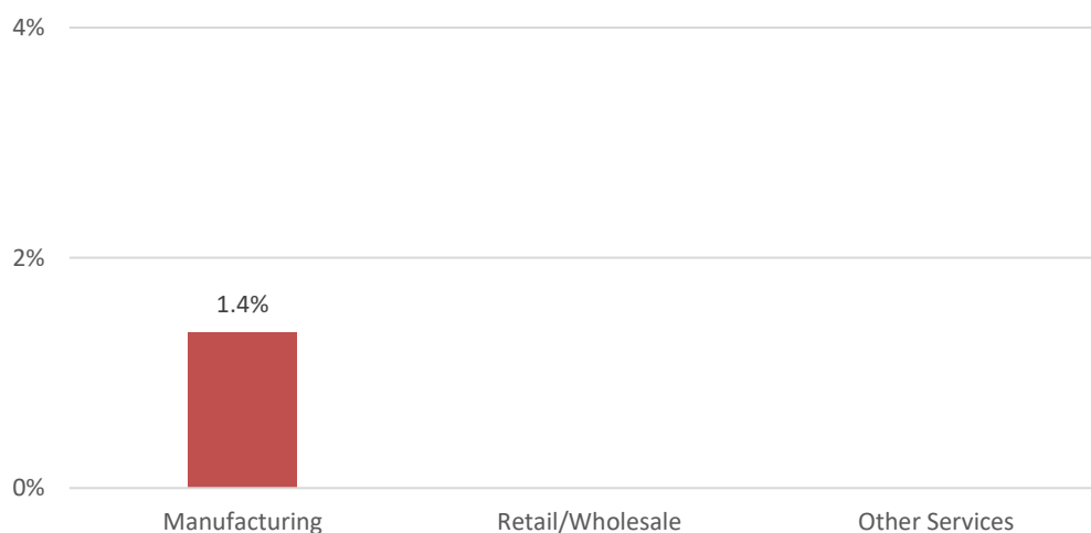
Sales Non-response Rates Chad ES, 2018

Survey non-response was addressed by maximizing efforts to contact establishments that were initially selected for interview. Attempts were made to contact the establishment for interview at different times/days of the week before a replacement establishment (with similar strata characteristics) was suggested for interview. Survey non-response did occur but substitutions were made in order to potentially achieve strata-specific goals; whenever this was done, strict rules were followed to ensure replacements were randomly selected within the same stratum. Further research is needed on survey non-response in the Enterprise Surveys regarding potential introduction of bias.